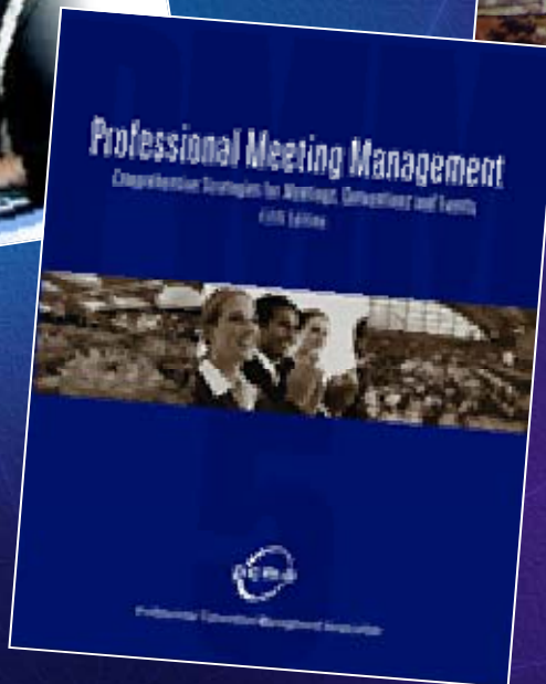
5 th Edition PCMA Manual