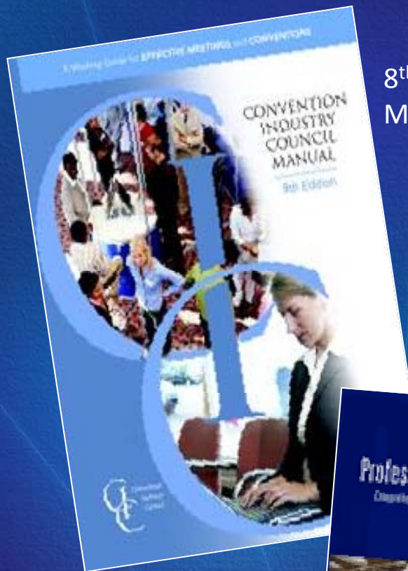
8 th Edition CIC Manual