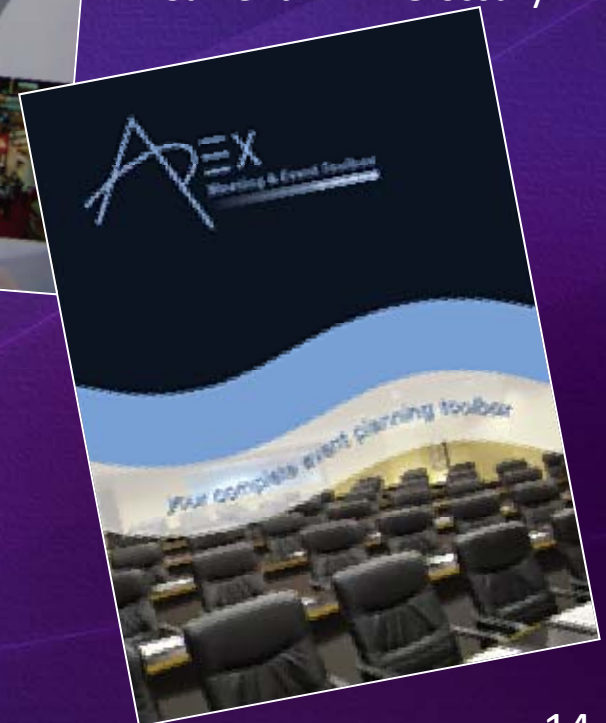
Current APEX Glossary