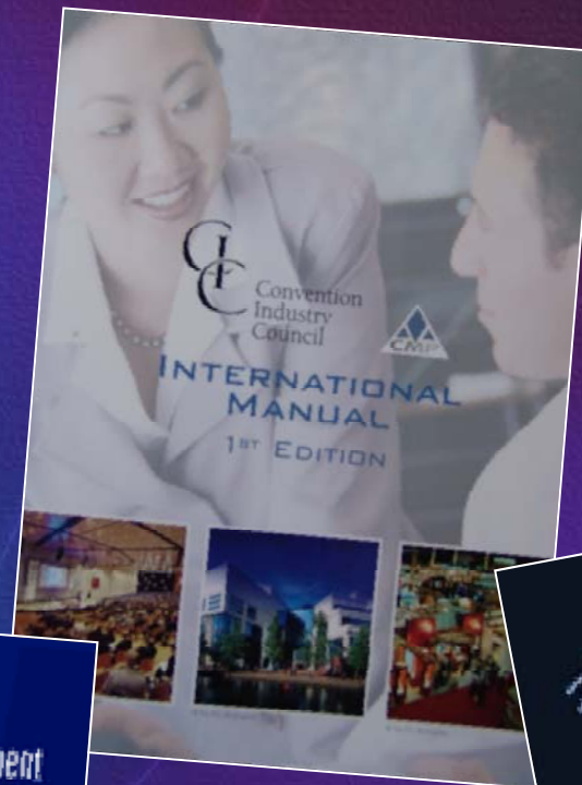
1 st Edition CIC International Manual